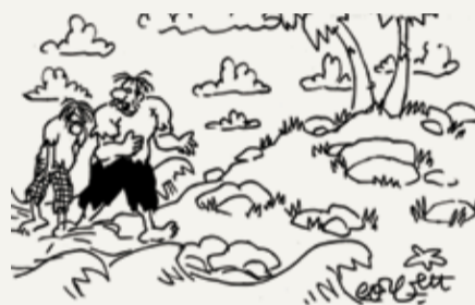
"First, we need to decide, who's Robinson Crusoe, and who's Friday..."

My country is the servant of a castaway.